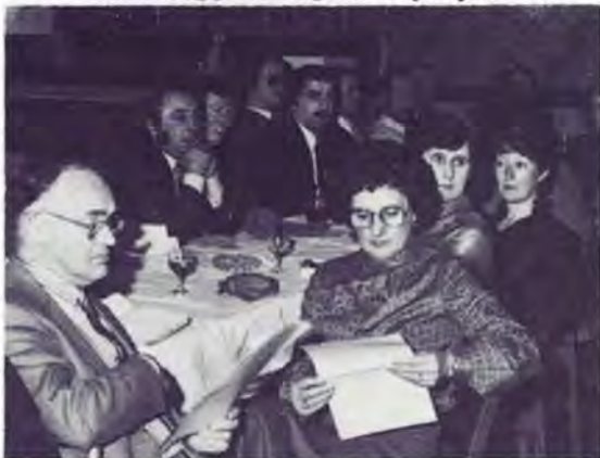
Following proceedings at Aberystwyth.