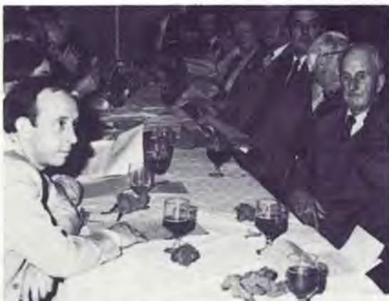
More Aberystwyth delegates.